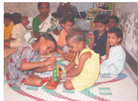
Together we can