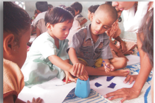
Working towards a collage sticking activity

Many parents feel that their child will learn more in a special school because the teachers are trained and the children will be given more attention. They also feel that in a regular school, the studies are very hard. It has been seen through research that the disabled and non - disabled do better if they study together.