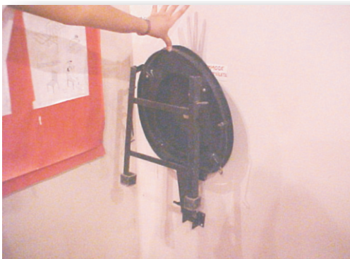
Foldable toilet seat