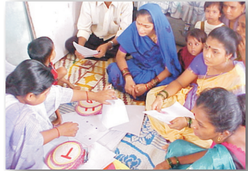
Discussing the children's performance with parents

The contents of small group meetings should cover