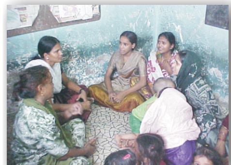
Parents meeting discussing the future of the children

If children see and work with children with disability from the beginning then this will not be a problem. It has been seen that children accept people who are different from them. There may however, be some teasing at school. But this happens with other children too. Sometimes this could be because they have not seen disability before and do not know what to do or say. It helps if children with disability are introduced to them and the disability is explained.