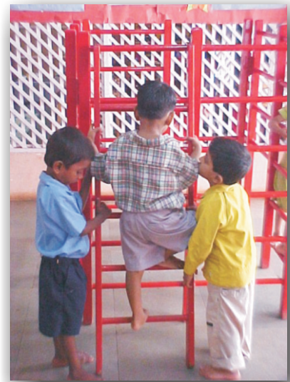
Learning can be fun

Inclusion of children with disability into mainstream schools has benefits for everyone. Children with disabilities have more friends, learn from their friends without disabilities, and live in the same society as others instead of being in a separate, special school. This raises their confidence and self-esteem. Children without disabilities learn about differences, learn to adjust, be tolerant and are more helpful to others.