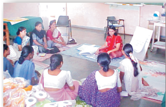
Community workers training programme

Then we need to train the teachers of the regular schools and tell them about disability. This can be done through programmes for teachers. Parents can also talk to teachers, as they know their children best.